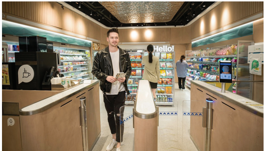
Cloudpick’s machine vision system offers constant surveillance as shoppers select the items that they need.

“The Intel OpenVINO Toolkit provides all kinds of model zones, which simplifies the evaluation of model performance and accuracy,” Li says, adding that the RealSense engineering team provided helpful guidance throughout the development of the machine vision system. “They were quick to respond